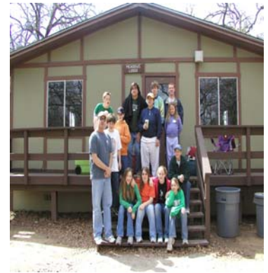
Campers at the 2006 Campout