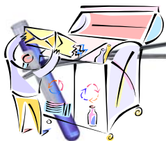
Donate to The Arc of Denton County

Get involved with Arc! If you are cleaning out, please donate clothing and household items. Call 214-337-8900 to schedule a pick up of large items. If you have clothing to donate there are deposit boxes in Lewisville at this time. The loca-