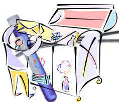
Donate to The Arc of Denton County

Get involved with Arc! If you are cleaning out, please donate clothing and household items. Call 214-337-8900 to schedule a pick up of large items. If you have clothing to donate there are deposit boxes in Lewisville at this time. The loca-